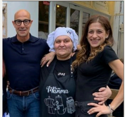
Filming with Stanley Tucci

Stanley Tucci, Searching for Italy season 2, episode 4